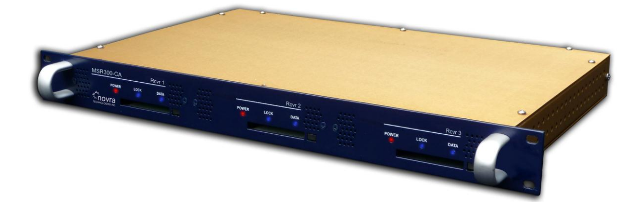
Figure 4 – Novra IPTV MSR Rack